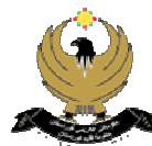
Kurdistan Regional Government