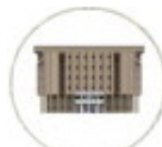
Kurdistan Parliament - Iraq